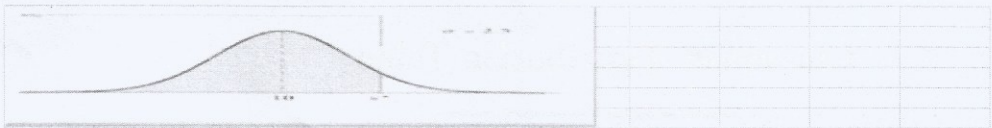
Area under the Normal Curve P(Z \leq z) From -3.49 to 3.62