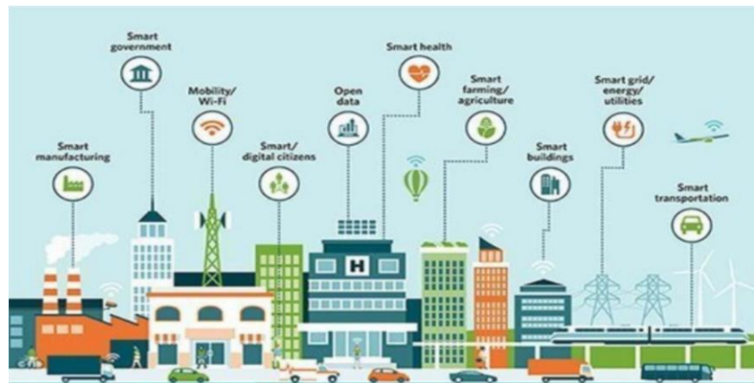
Figure 1: Smart City Components (Facilitator, 2021)

The smart city has various components that enable it to be called ‘smart’ and these include smart citizens who use technology for communication and everything else, mobile network/ Wi-Fi access and open data that is accessible to all. This includes smart health, where transactions are done online, smart government, smart farming, a smart grid with clean energy sources, smart buildings, smart manufacturing and smart transportation (Silva et al. , 2018; Singh et al. , 2021) (Figure 1). The ‘smart’ is representing reduced carbon footprints and environmental exploitation and industrial emissions. It is a digital city that provides services and passes information through digital and technological means (Rathore et al. , 2021).