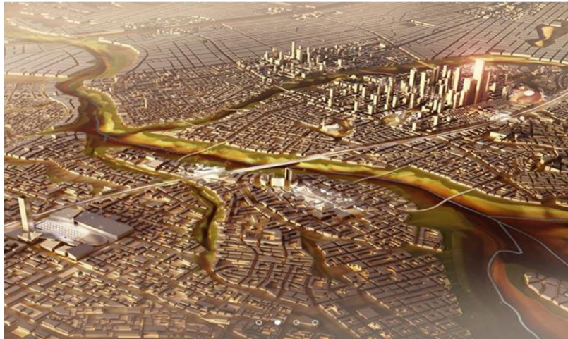
Figure 2: Master Plan of the New Capital Cairo.

The New Cairo Capital is a smart city proposed to change and embrace smart technology (Hassanein, 2017). The proposed area is about 700km 2 of high and medium residential areas, with about 200km 2 as natural preservation areas (Figure 2). The city embraces the old one and is connected with it through public transit links. The city is also concerned with education, quality of life and economic opportunities, especially for the younger generation whilst conscious of environmental sustainability.