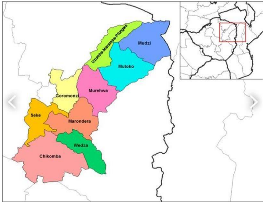
Figure 1: Mashonaland East Province