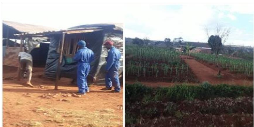
Plate 5: Economic survival strategies (Field survey, 2022)