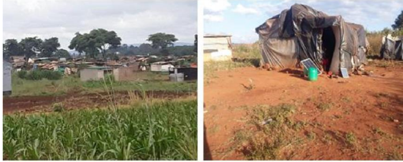
Plate 4: Nature of houses in Magamba, Hatcliffe Extension (Field survey, 2022)

The first picture on Plate 4 shows how houses look from a distance and the second one shows one of the houses in the community. In general, houses as shown in Plate 4 are made of plastic sheets, boards and wood tents indicating poverty. Most poor people have access to housing through cooperatives. Plastic sheets, wood boards, metal scraps and grass shacks are the materials that were used to construct most houses as shown in the pictures. The settlement depicts typical slum or squatter or informal settlements in Zimbabwe. Most families have a one-roomed house. The area is limited for any form of expansion (100-150 square metres per household), hence overcrowding is an issue. Parents and children share a single room, hence moral and cultural ethics have been compromised.