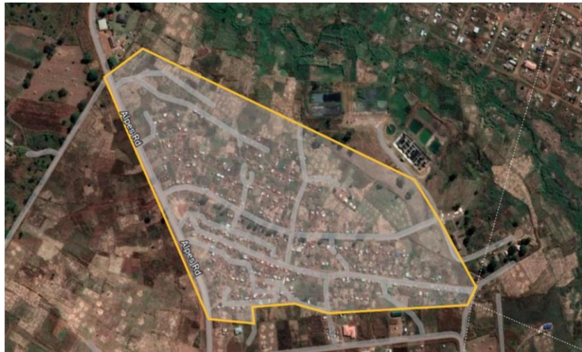
Plate 1. Study area map of Magamba slum (Google Earth)

The insights of this study are from Magamba, a slum that developed and is still growing in Hatcliffe Extension, 21 kilometres north of Harare. Magamba slum falls under Ward 42 of Harare North Constituency, along Alpes Road, close to a newly developed community of University of Zimbabwe lecturers (Plate 1). Hatcliffe Extension was previously a detention centre for urban migrants from across Harare. Magamba community has an estimated population of 2 000 people. Magamba is a community with a mixed composition in terms of age groups. Young persons aged 15 to 35 account for a larger proportion of the community's population. Water, sewer systems, proper roads and other urban facilities were typically lacking in these newly formed settlements (Chitekwe-Biti, 2009).