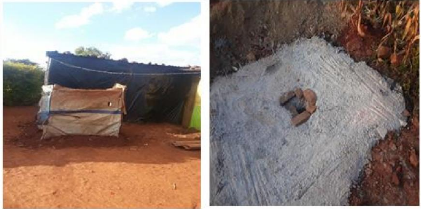
Plate 3: Sanitary facilities (toilets) are being used by residents (Field survey, 2022)

Plate 3 depicts Blair toilets. In the first picture, the toilet is currently under use and is encircled by white tents or plastic sheets for the privacy. The second picture is a new Blair toilet of a newcomer under construction. It is interesting to point out that new residents are coming and flocking into the place and can build wherever they wish.