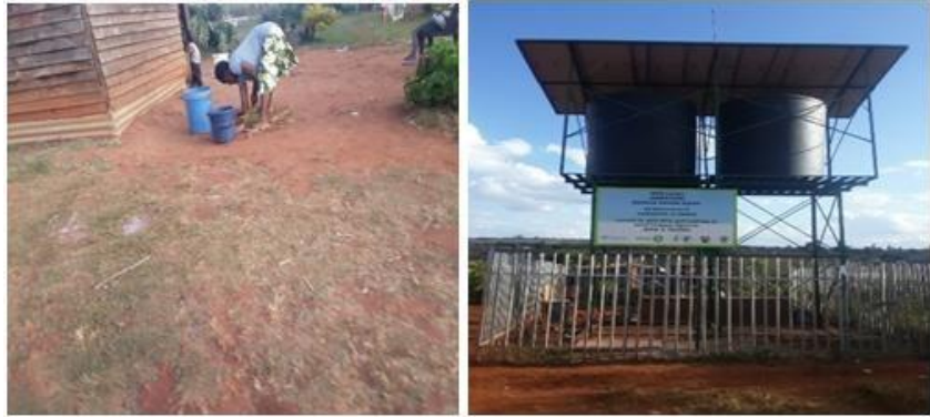
Plate 2: Water facilities in Magamba, Hatcliffe Extension (Field survey, 2022)

Shown in the Plate 2 are sources of water found in the community. The picture on the right shows a recent initiative to help the community with portable and safe water. The initiative is called Hatcliffe Magamba Piped Water Scheme installed in 2020. Social distancing at water points remains theoretical in most communities as residents stampede for the precious liquid. The water scheme reduced the potential risk of contracting and spreading the COVID-19 as it decongested the one borehole that was serving the majority of the community. It was done by Oxfam Zimbabwe in partnership with the City of Harare with the core objective of easing water challenges that were being faced by the community. Residents welcomed and appreciated this project as it provides them with safe, portable and reliable water. The initiative is said to have eased pressure or decongested some water points to a limited extent as water has some limits of three buckets (60 litres) per family or household a day as the scheme is affected by the weather. The availability of water depends on solar energy as water is pumped using solar pumps.